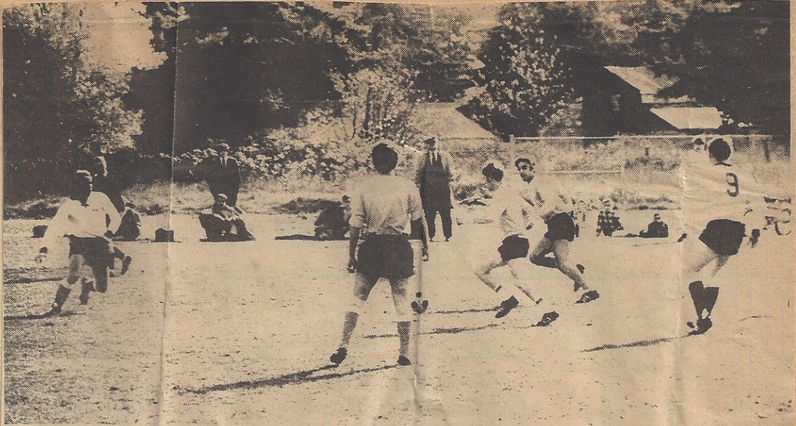
Western's soccer team starts another offensive drive en route to their 5-0 victory over Seattle Pacific last Saturday.