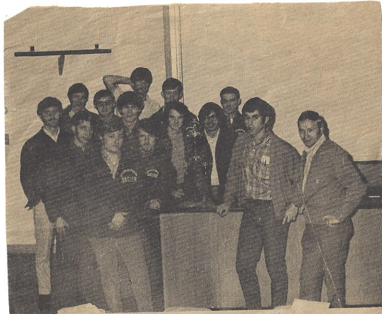
Western's soccer club is shown here with the trophy they received last Tuesday. The trophy was for winning the Western Washington Soccer Conference last fall.